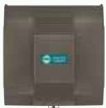
HCWP3-18 Power Humidifier 18 gallons per day

Equipped with a built-in fan, a Power Humidifier circulates humidified air. Since it works independently of your HVAC system, it can deliver humidity even when your system isn't running.