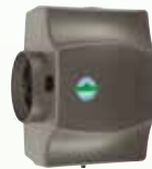
HCWB3-17 Bypass Humidifier 17 gallons per day

Bypass Humidifiers work in conjunction with your HVAC system, using the air handler or furnace fan to direct humidified air throughout the home.