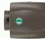
HCWB3-12 Bypass Humidifier 12 gallons per day